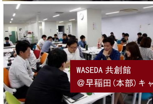
WASEDA 共創館 @早稻田(本部)キャンパス