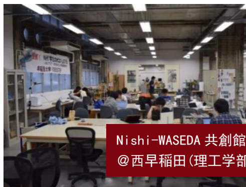
Nishi-WASEDA 共創館 @西早稻田(理工学部)キャンパス